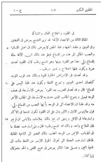
Figure 2. A chapter of Al-Hawi is devoted to facial palsy, Chapter 6, Volume1.

“Laghwa or facial palsy: this disease which occurs suddenly and half of the face has flaccid paralysis and distorts and deviates to the opposite side. Therefore if the muscle of left-side of lip is involved, lip is pulled to the right side, and that part of jaw and cheek are also affected.