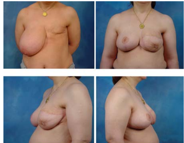
Figure 3. A Location of mastectomized site in a 50 year-old female 2 years after ablative surgery is shown.